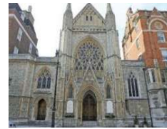
Farm Street Church Entrance