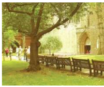
Mount Street Gardens Entrance