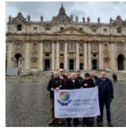
Pope Francis' Ash Wednesday Mass, Santa Sabina - St. Peter's Square, 2023