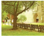
Mount Street Gardens Entrance