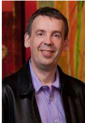
KEYNOTE SPEAKER : JAMES ALISON

SATURDAY, 25 MAY 2024, LGBT+ CATHOLICS WESTMINSTER 25 TH ANNIVERSARY DAY-CONFERENCE: LGBT+ CATHOLICS IN A SYNODAL CHURCH LONDON JESUIT CENTRE, 114 MOUNT STREET W1K 3AH.