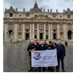
Pope Francis' Ash Wednesday Mass, Santa Sabina - St. Peter's Square, 2023

Please contact secretary@lgbtcatholicswestminster.org if you would like to join us. Limited to 20 places, we already have 14 names confirmed. £150 Deposits to secure accommodation are required NOW. 2025 will also be a Holy Year - Jubilee 2025 - with special events in Rome.