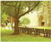
Mount Street Gardens Entrance