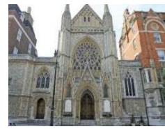
Farm Street Church Entrance